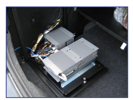
Locking latch provides a safe and secure mounting area. (C-TSM-CHGR-D shown)